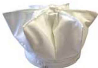
high performance star filter Ø 400 (cod Q06992304)